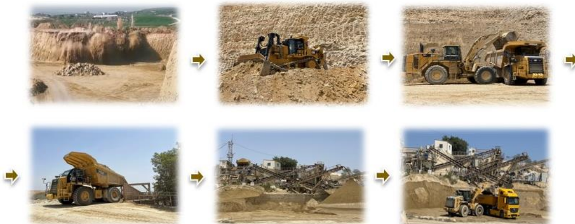
Figure 2. A summary of the excavation and production process