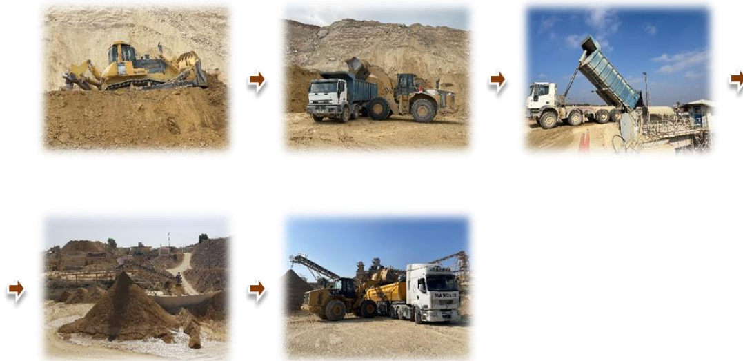
Figure 2. A summary of the excavation and production process