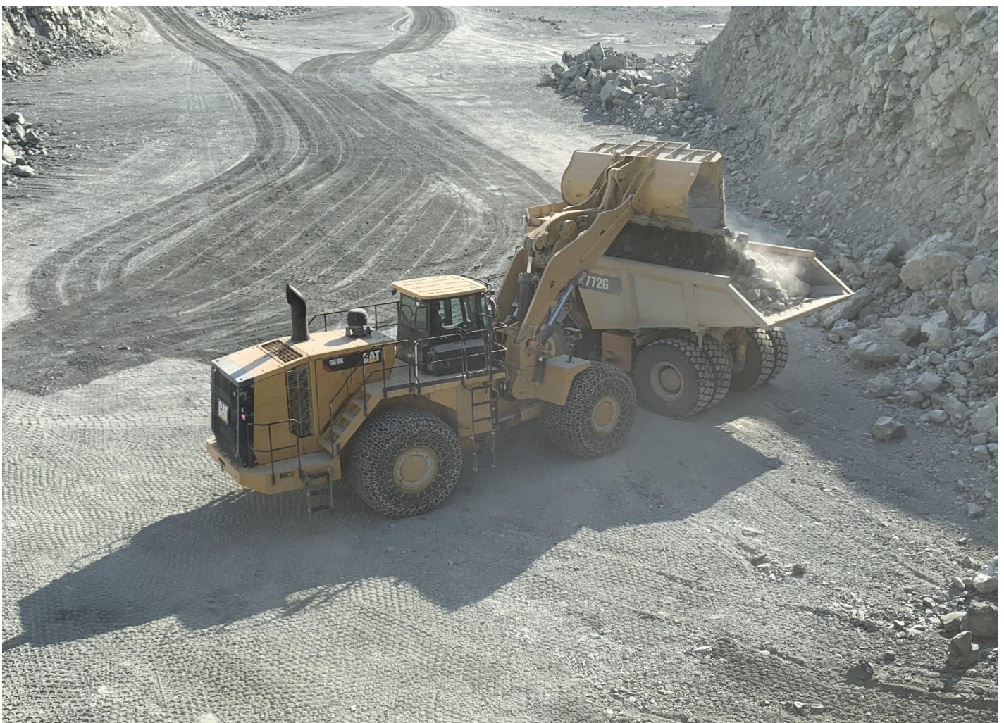
Figure 4. The loading of the extracted material

HWD: Hazardous waste disposed, NHWD: Non-hazardous waste disposed, RWD: Radioactive waste disposed, CRU: Components for re-use, MFR: Materials for recycling, MER: Materials for energy recovery, EE: Exported energy