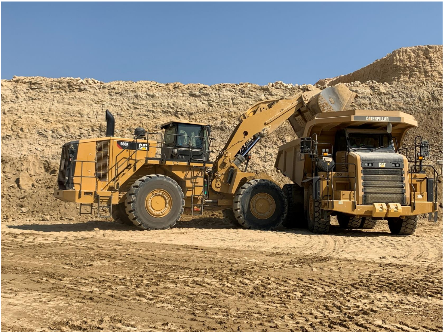
Figure 4. The loading of the extracted material

HWD: Hazardous waste disposed, NHWD: Non-hazardous waste disposed, RWD: Radioactive waste disposed, CRU: Components for re-use, MFR: Materials for recycling, MER: Materials for energy recovery, EE: Exported energy