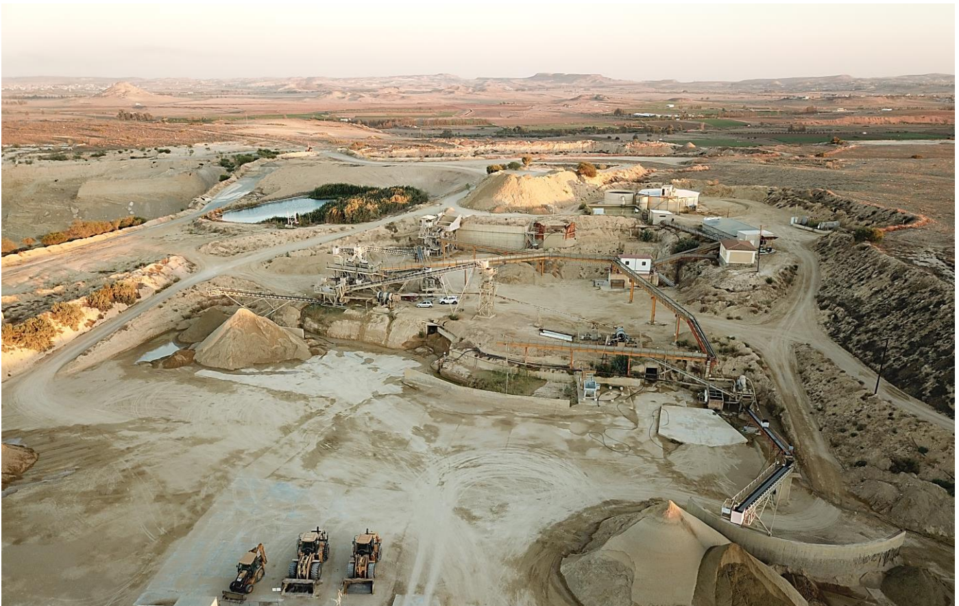
Figure 3. Aerial photo of Elmeni crushing plant

Waste disposal concerning sludge and gravel is excluded from the study since the total quantity of waste generated from the manufacturing process is used for quarry restoration treatment.