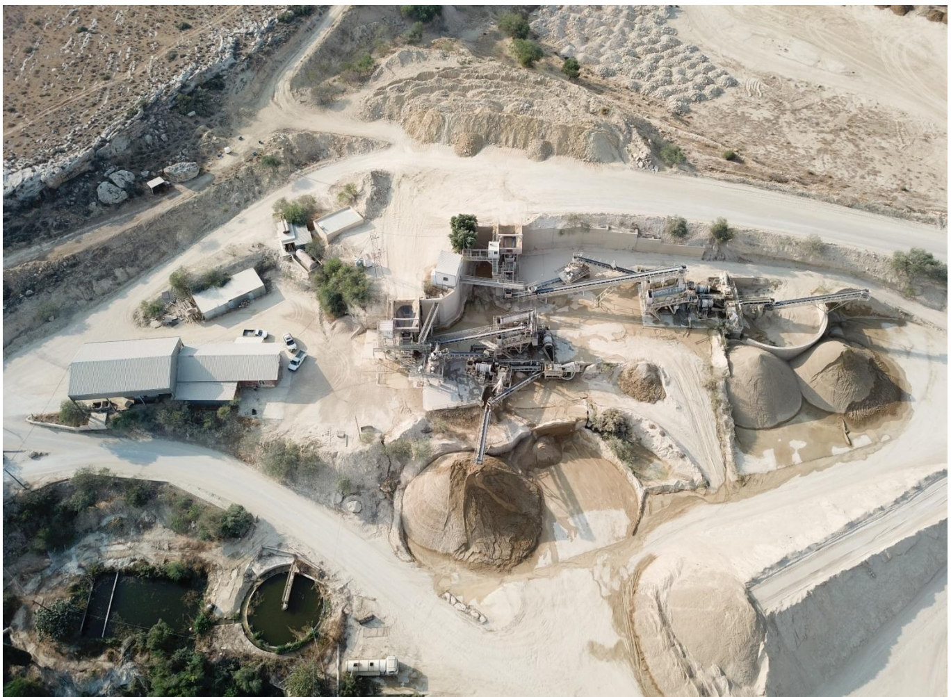
Figure 3. Aerial photo of Latouros crushing plants

Waste disposal concerning sludge and gravel is excluded from the study since the total quantity of waste generated from the manufacturing process is used for quarry restoration treatment. Only waste disposal concerning mineral oils was taken into account.