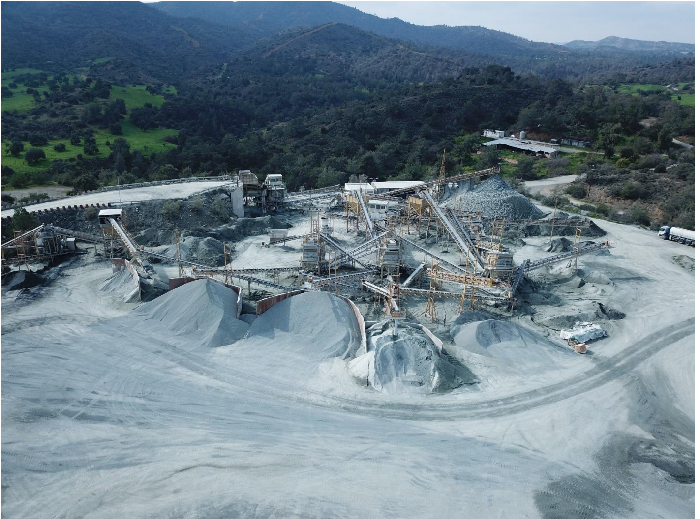
Figure 1. Aerial photo of Pyrga Quarry crushing plant

The products do not contain any substances listed in the “Candidate List of Substances of Very High Concern (SVCH) for authorization” exceeding 0.1% of the weight of the product.