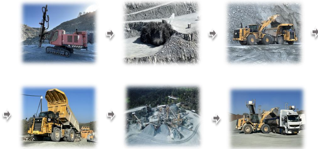
Figure 2. A summary of the excavation and production process