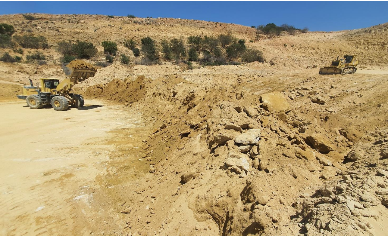
Figure 1. Excavation of raw material

The products do not contain any substances listed in the "Candidate List of Substances of Very High Concern (SVCH) for authorization" exceeding 0.1% of the weight of the product.