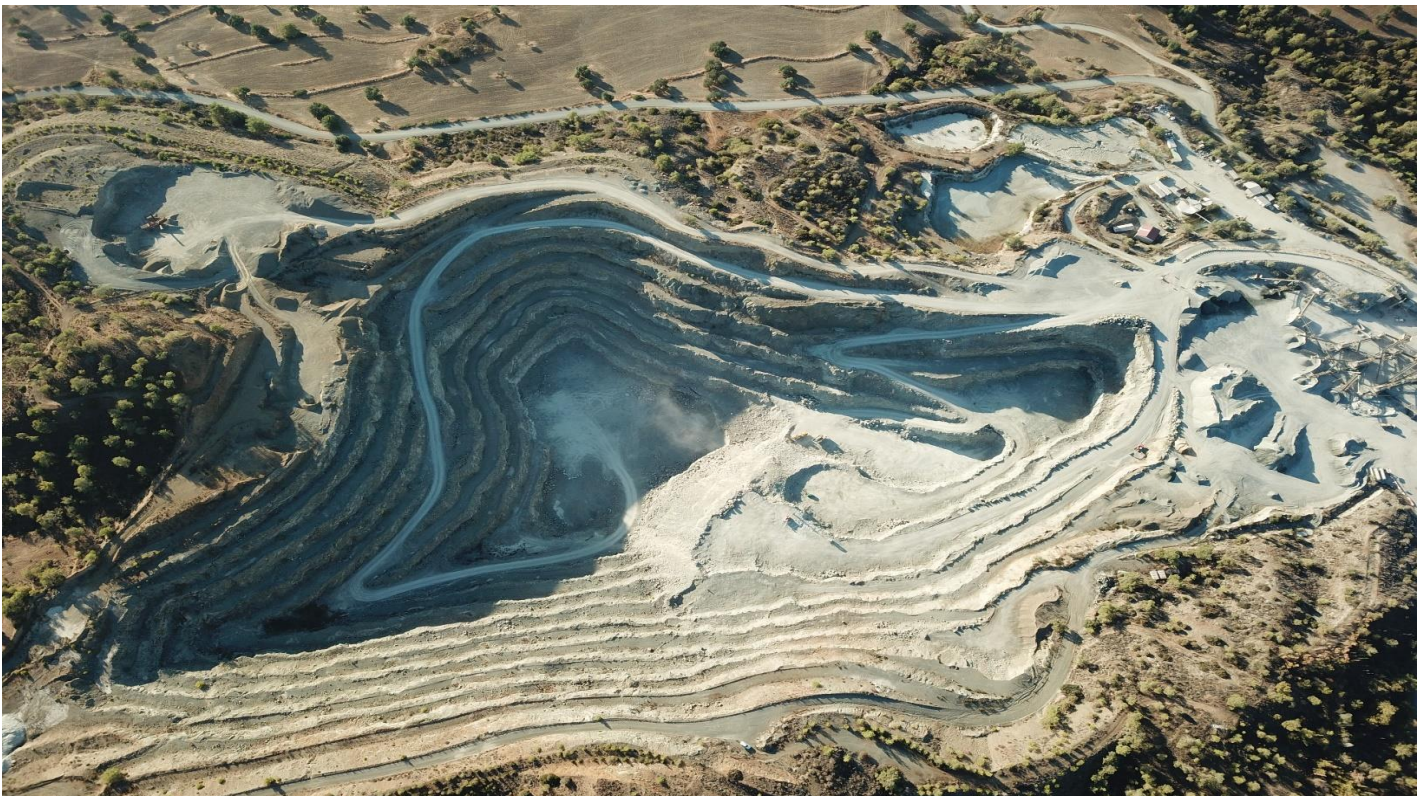
Figure 3. Aerial photo of the quarry pit

Waste disposal concerning sludge and gravel is excluded from the study since the total quantity of waste generated from the manufacturing process is used for quarry restoration treatment. Only waste disposal concerning mineral oils was taken into account.