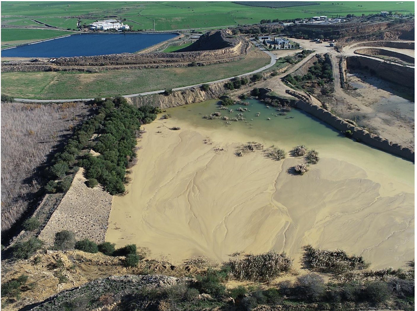
Figure 4. Rehabilitation of the old quarry pit

HWD: Hazardous waste disposed, NHWD: Non-hazardous waste disposed, RWD: Radioactive waste disposed, CRU: Components for re-use, MFR: Materials for recycling, MER: Materials for energy recovery, EE: Exported energy