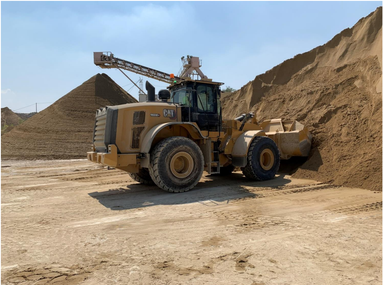
Figure 1. Loading of the final product onto customer trucks

The products do not contain any substances listed in the "Candidate List of Substances of Very High Concern (SVCH) for authorization" exceeding 0.1% of the weight of the product.